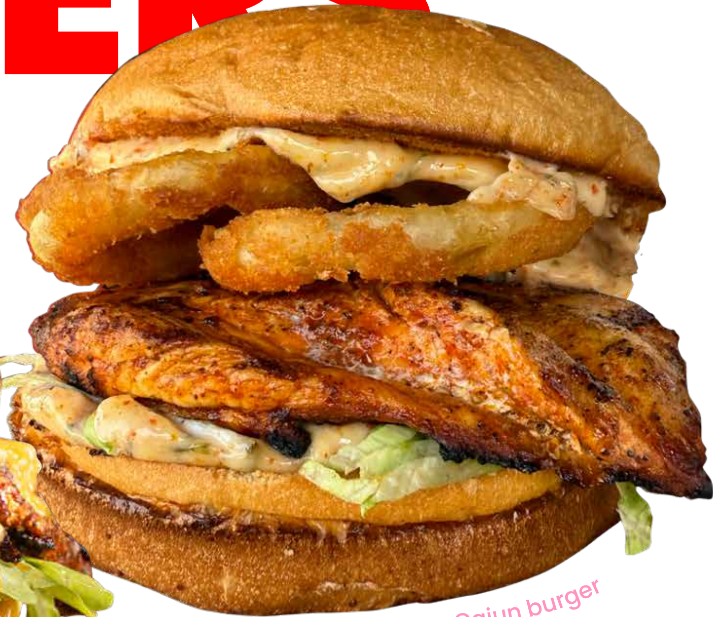
Chicken Cajun burger

CHICKEN CAJUN: $10.5 Grilled chicken breast (150g), iceberg, dill pickles, onion rings and Cajun sauce