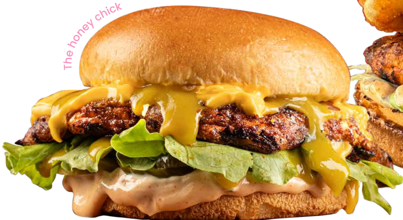
The honey chick